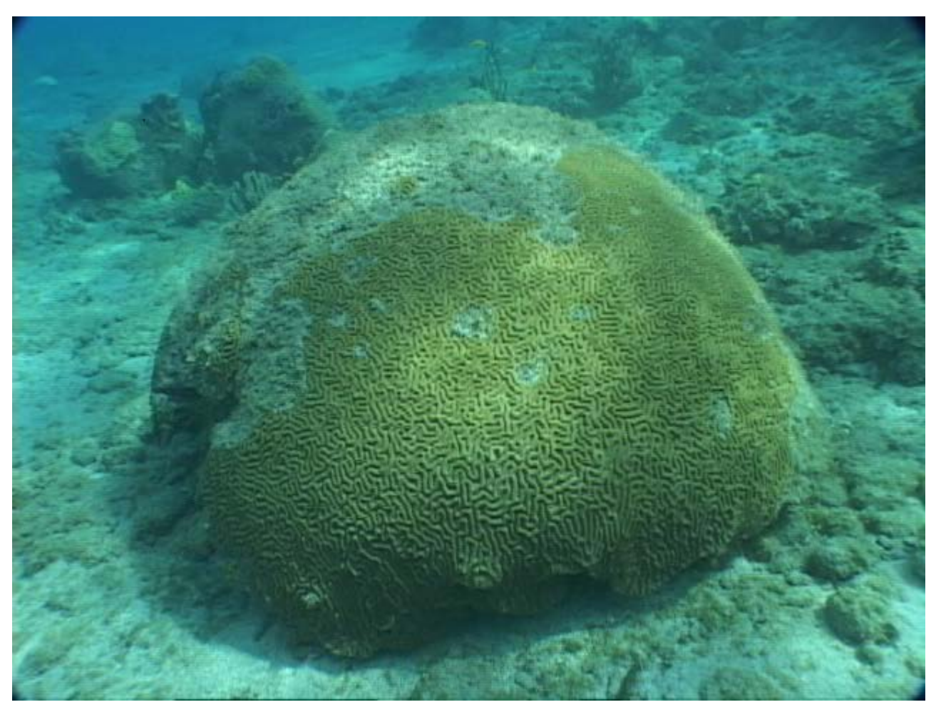
Fig.1.3 climate change impact on marine environment

In order to address impacts of climate change on coastal on coastal and marine resources, the Government of Dominica will: